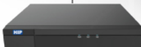
Network video Recorder